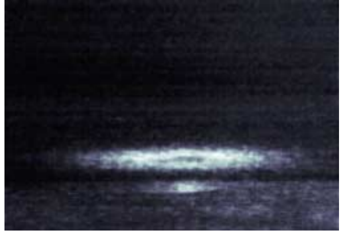
Figure 1. Enhanced image of an Elve captured in orbit 44.

In the first MEIDEX sprite observation during orbit 44 (January 19 th 09:05:23.94 UTC), Mission Specialist David Brown tracked a very active thunderstorm with continuous visible lightning activity located over the Pacific Ocean to the east of the Java-Fiji region. At the time of the event, the shuttle was pointing at 23°S 159°E and range of the storm center from the shuttle was 1635 km. When the video data was analyzed, the image in Figure 1 was retrieved, showing an Elve with the classical ring-like structure. The calculated altitude above the ground was 88 \pm 8 km. The unique doughnut shape with the